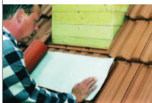
Lengthening the material