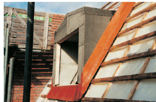
Dormer ready prepared for cladding