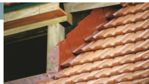
Dormer window connections with flashing

bleiCOLOR-SK is a totally self-adhesive metal sheet for all flashings and seals on roofs. It is especially suitable for sealing the roof to features such as chimneys etc. The colour of the coated surfaces suites all commonly used roofing colours, is long lasting resistant, and does not loose its attractiveness.