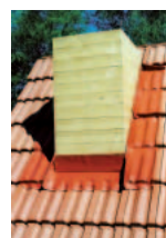
Chimney sealed with flashing