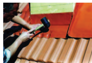
Sticking and shaping