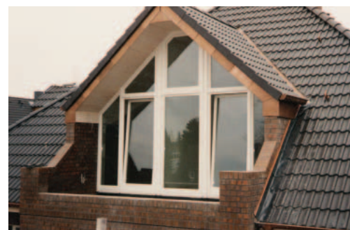
Closure and seal to the sides with bleiCOLOR