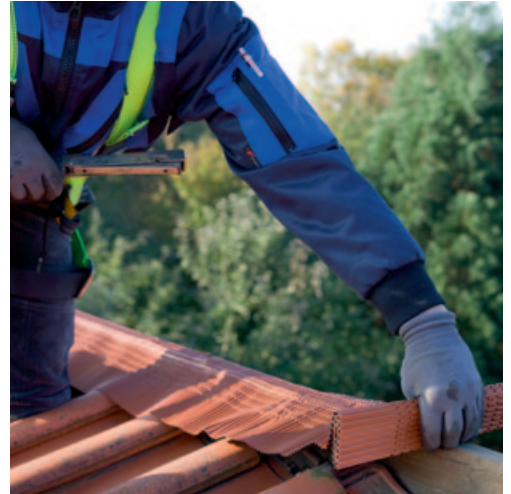
Freewheeling on the ridge