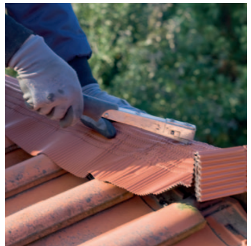
Nail in the middle or tack in place