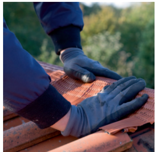
Shape, no glueing required