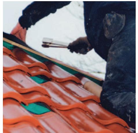
Nail in the middle or tack in place