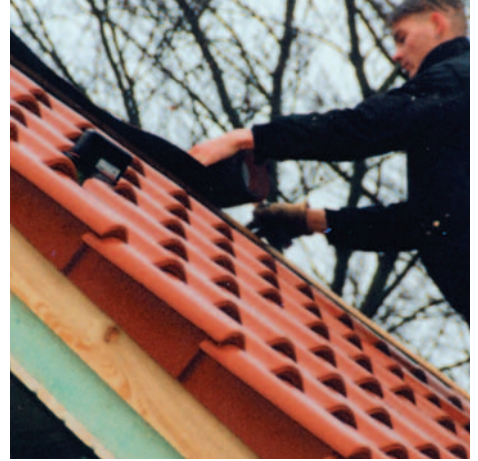
Freewheeling on the ridge