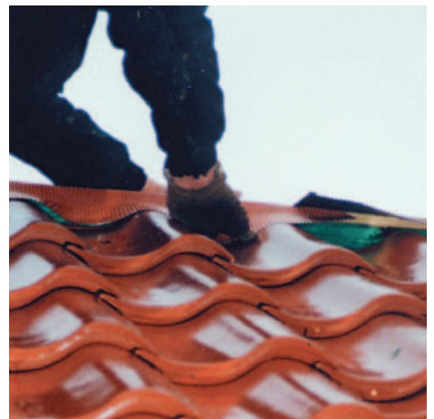
Shape, no gluing required