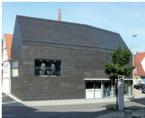
Venusblei façade on the Pierre Cardin outlet in Metzingen.